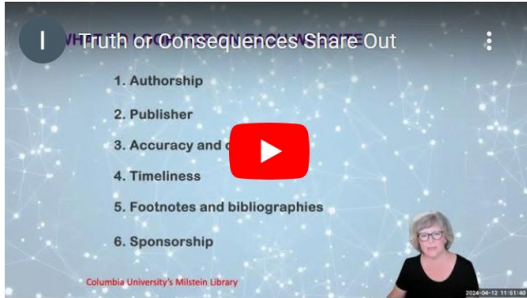
Truth or Consequences Candace Windel, Teaching Fellow