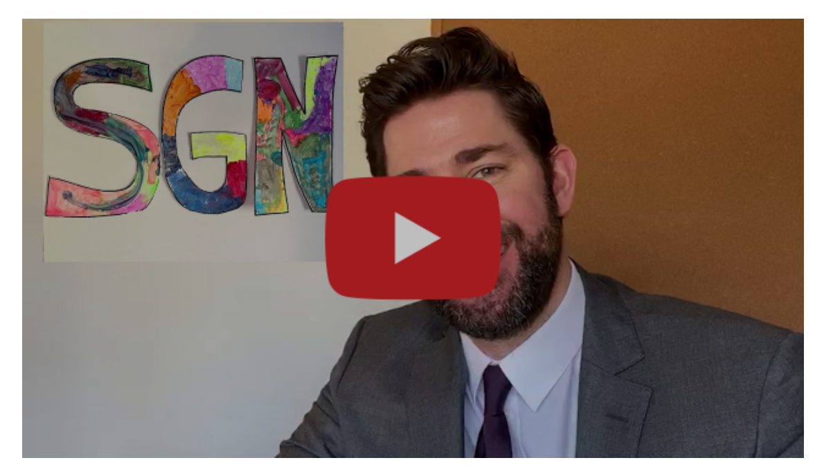
Check out this video for "Some Good News"

Feeling isolated? Miss connecting with your colleagues? Or just want to talk to someone other than your dog? All faculty are welcome to join us every Friday through the end of the semester from 11:30-12:00pm CST for an informal social gathering. Topics of discussion in our breakout chat rooms will vary each week and will develop based upon your interests. Bring your own beverage of choice and join us for some brief social exchange. To join, click <u>HERE</u>. Hope to see you there!