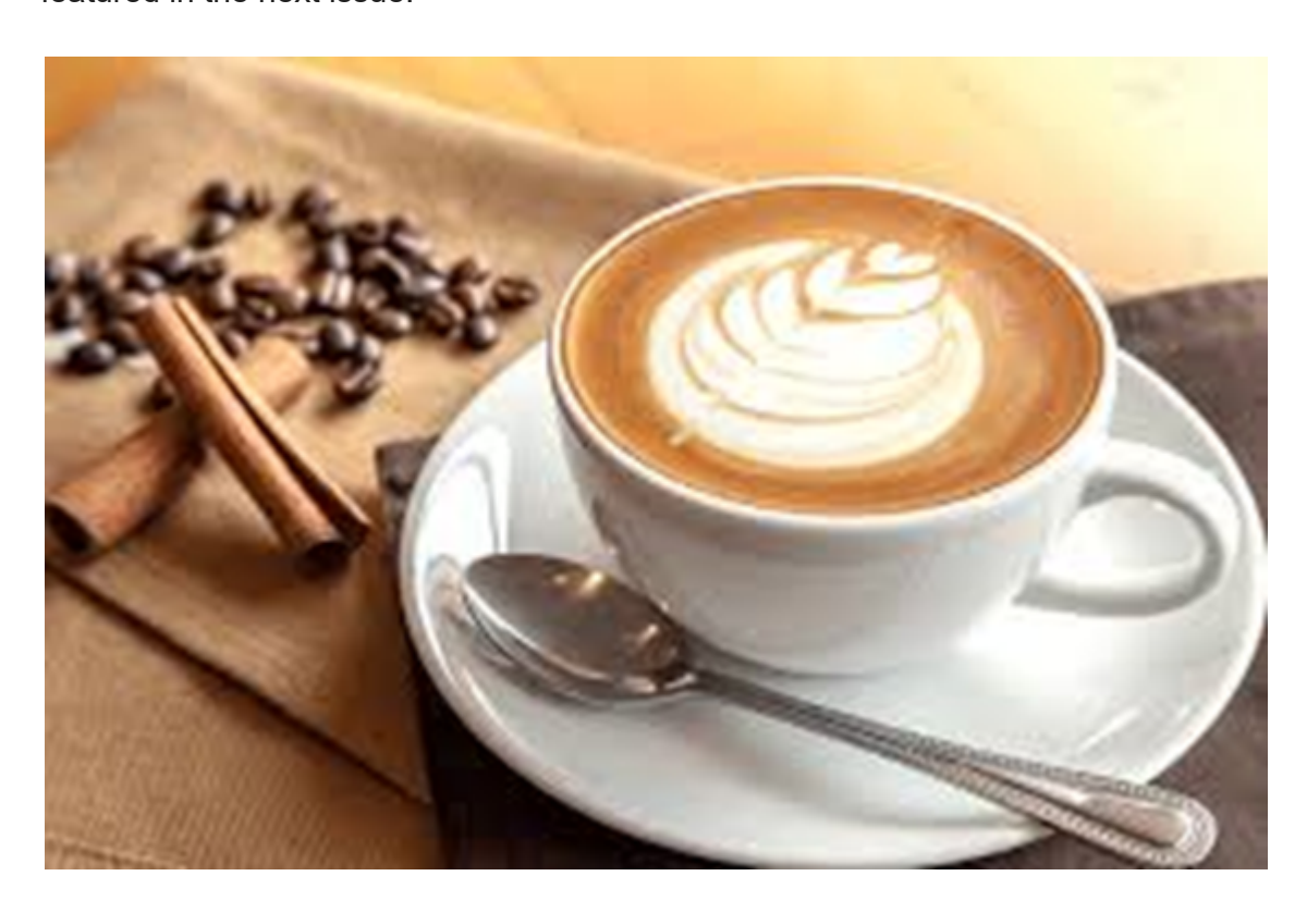
Virtual Coffee House

We know that many of you already have stories of exceptional student resilience, stories of new strategies you've employed that could help other instructors, and stories of great teaching & learning during times of change. We kindly invite you to share those stories with us and the Park community <a href="HERE">HERE</a>. All submissions will be entered in a raffle to receive a gift at the end of the semester, and your story may be featured in the next issue!