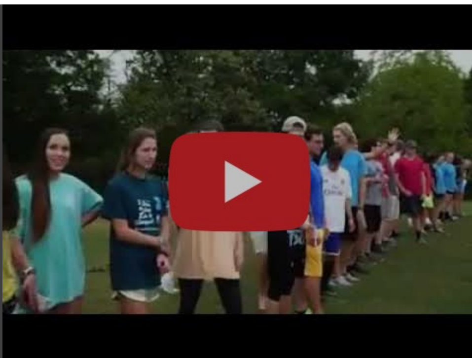
Privilege/Class/Social Inequalities Explained in a $100 Race

As an institution, Park is striving to understand more about our strengths and opportunities for growth in the areas of diversity, equity, and inclusion. We know that, like learning, this should be a continuous and evolving process—and one informed by perspectives outside of our walls. In this issue, we are pleased to share food for thought as we learn and grow together on our continuous journey to celebrate diversity, advocate for social justice, and create a more inclusive world.